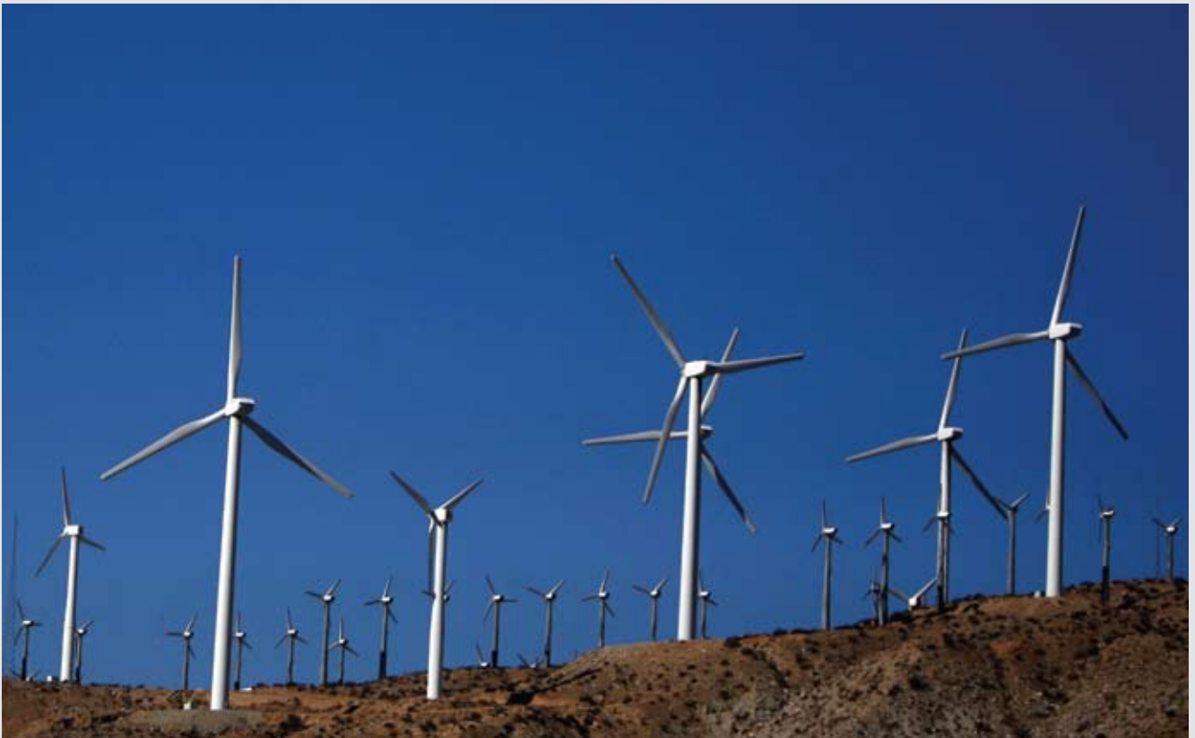
Branching out: Cyprus is embracing renewables, with a focus on wind power

assistant director-general of Cyprus Employers and Industrialists Federation (OEB). "It is based on a tripartite gentleman's agreement between employers, the unions and the government as mediator. The system protects employees under EU regulations, but it also allows employers to protect their own interests through lockouts, though it should be noted that this has only been used twice in the past 25 years." This is of particular interest to the more than 40,000 foreign companies registered in Cyprus.