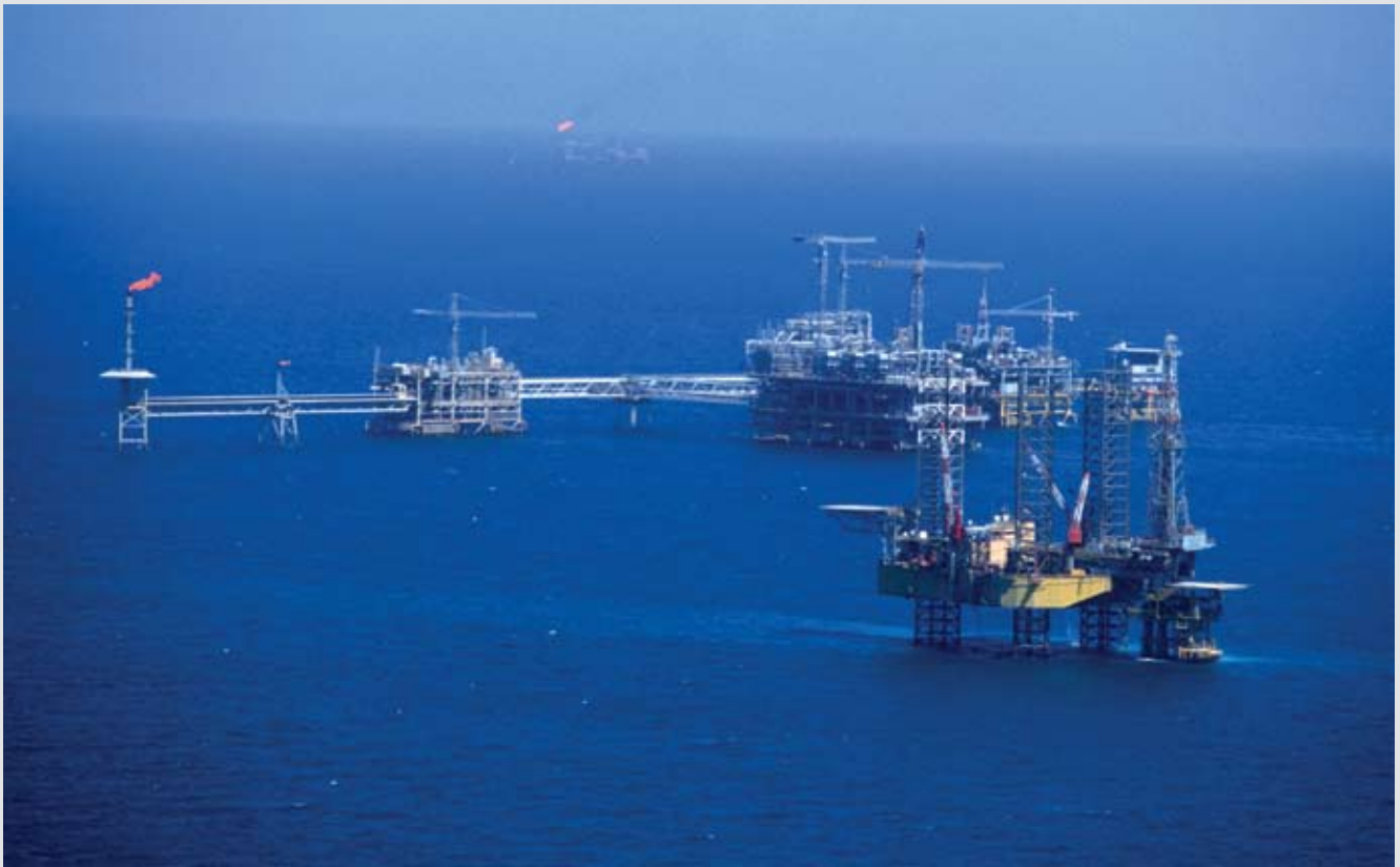
Multifaceted economy: Cyprus provides innovative mechanical solutions for the oil and gas industries

mean entrepreneurs on both sides are finding it an increasingly attractive jurisdiction through which to route business."