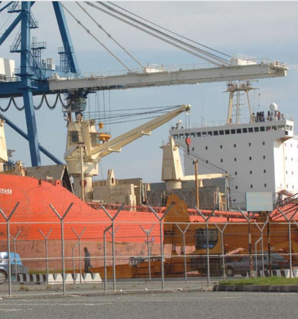
Shipping hub: Limassol's deep sea multipurpose port

“CYPRUS IS THE GATEWAY FOR THE MOVEMENT OF GOODS AND SERVICES INSIDE AND OUTSIDE THE BORDERS OF EUROPE. OUR COMPETITORS ARE DEFINED BY THEIR GEOGRAPHICAL AND SECTORAL FOCUS, BUT THE ADVANTAGE OF CYPRUS IS MEMBERSHIP IN THE EU”